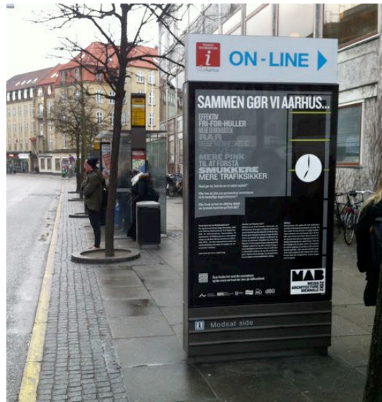
Figure 3: CBR promotion poster

The two elements was not directly linked on the technical level and the bug reports was not displayed on the façade, partly due to the difference in the dataset and partly due to the potentially low content level for long periods of the short installation time. Instead we utilized the high visibility of the media façade as a way of promoting the reporting service, with a poster in the existing information pylon right beneath the city hall tower, placed outside the primary citizen service (Fig. 3).