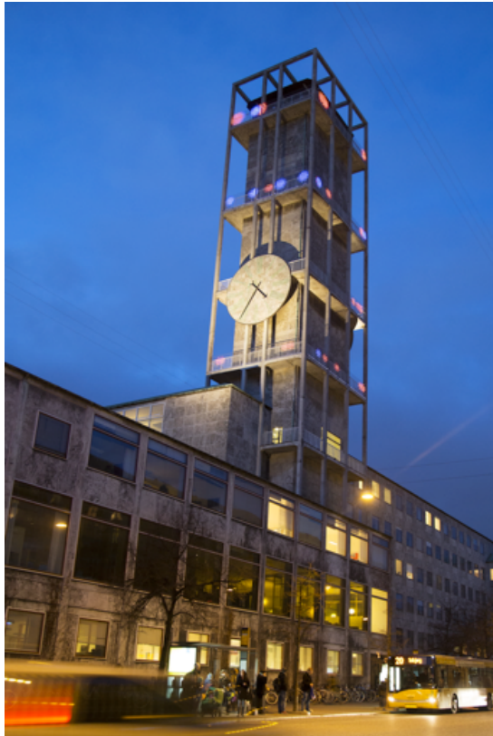
Figure 1: CBR: Media façade at city hall tower.

given a color depending on whether it came from the citizen (question: red) or from the administration (answer: blue). When a question was posted, a red spot spawned on the facade at the lower ribbon, and when the question was answered it turned blue. When a transaction occurred, the specific dot would jump up a ribbon and grow in size. If/when the case was closed, the dot disappeared. The core idea was to avoid too many unanswered questions, represented by red dots, and—more importantly—to avoid any drifting red dots at the uppermost ribbon, indicating a question that remained unanswered.